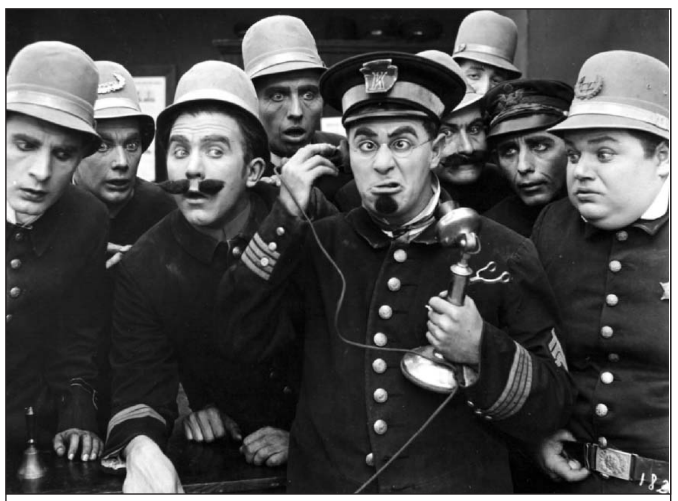
"Keystone Kops" (1914)

was also a replica of a legal document describing five years of improvements to the land. This included a description of the farmhouse and landscaping, with inventories of cattle and poultry.