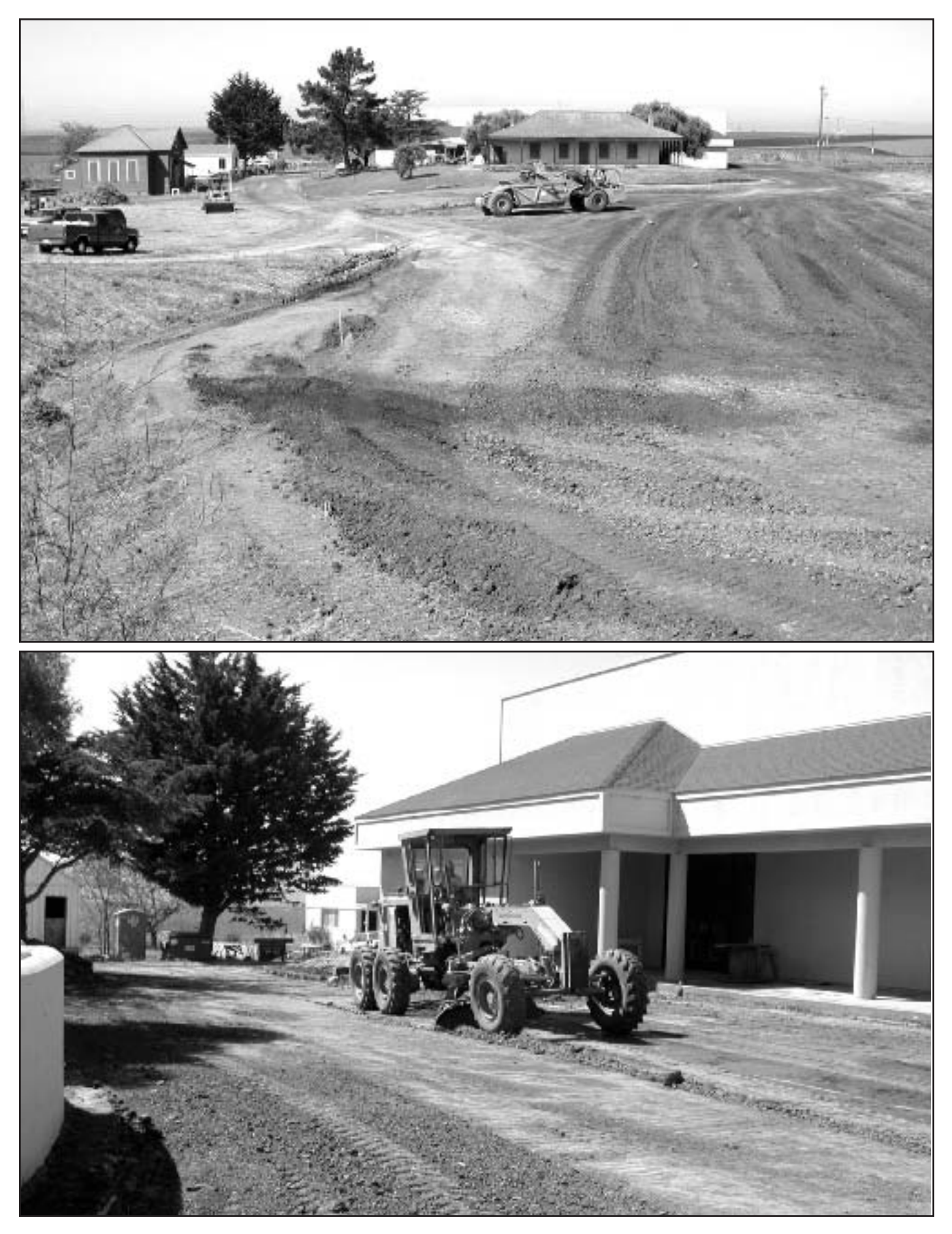
Landscape grading at the Boronda Adobe History Center, September 21, 2005.